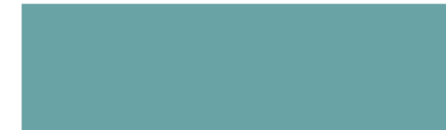
R19/64 Planned H19mm x W64mm Unplanned H22mm x W67mm Ref: R617