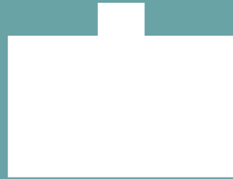
R 25/45 Planned H25mm x W45mm Unplanned H27mm x W47mm Ref: R447