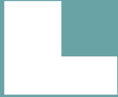
R23/28 Planned H23mm x W28mm Unplanned H25mm x W30mm Ref: N/A