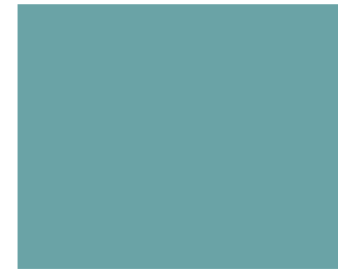
R35/44 Planned H35mm x W44mm Unplanned H37mm x W46mm Ref: R436