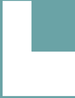
R33/43 Planned H33mm x W43mm Unplanned H35mm x W45mm Ref: R508