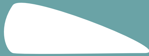
R20/63 Planned H20mm x W63mm Unplanned H21mm x W64mm Ref: R481